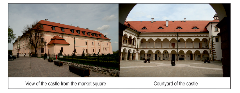
Fig. 3. Modernization and rehabilitation of Niepołomice castle as an example of gentrification processes