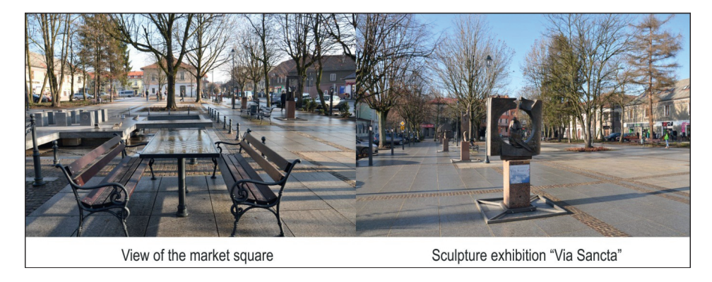
Fig. 2. Modernization and rehabilitation of Krzeszowice market square \,

process, where, after modernization of the area, a number of recurring artistic performances and cultural programs were introduced to attract residents and sometimes even visitors to the area (Fig. 2).